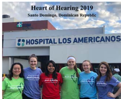
2019 Dominican Republic 2017 Australia 2017 Dominican Republic

Online Journals documenting our daily activities: