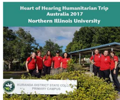
Heart of Hearing Humanitarian Research & Service Trip to the Dominican Republic (2019) Heart of Hearing Humanitarian Research & Service Trip to Australia (2017) Heart of Hearing Humanitarian Research & Service Trip to the Dominican Republic (2017)