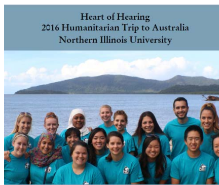
2016 Australia 2014 Cambodia 2013 China