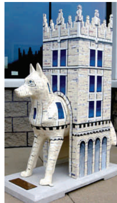
King Sponsored by: Castle View Real Estate Artist: Dan Wiemer