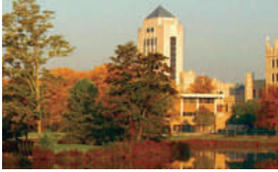
NIU East Lagoon in fall.

We the faculty have been working on the paper work for our transition to a DPT program for some time. We are now happy to say that we have handed off paper work to the curriculum committee and our project has started down the path to approval.